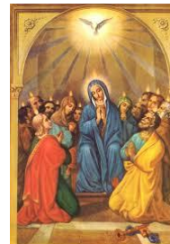
The Solemnity of Pentecost 9 th June