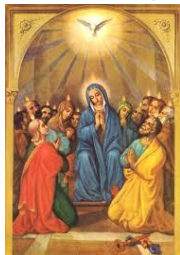
The Solemnity of Pentecost 9 th June