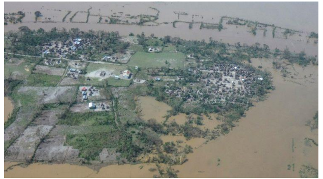
Flooding in Madagascar in the wake of cyclone Batsirai

Pope Francis prayed on Sunday for those who have died recently in natural disasters, for consolation for their families, and for support for those who assist them. In remarks following the Angelus prayer in St Peter's Square, the Holy Father looked especially to Madagascar, which has been struck by a series of cyclones; and to the Petropolis area of Brazil, which has been "devastated" by floods and landslides.