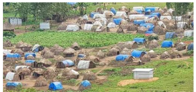
Blue plastic sheeting put to good use