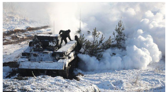
Russian troops carry out military drills in Belarus

As a host of Western nations urge their citizens to leave Ukraine, Pope Francis has renewed his prayers for the eastern European country. Speaking Sunday at the Angelus in St. Peter's Square, the Pope said the news coming out of Ukraine is "very worrying". He entrusted the situation to the intercession of the Blessed Virgin Mary, and